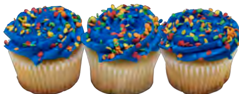
Cupcakes 20694 Available in your choice of icing color!