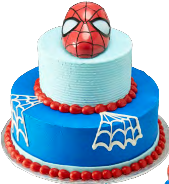
Two Tier Cake 7891