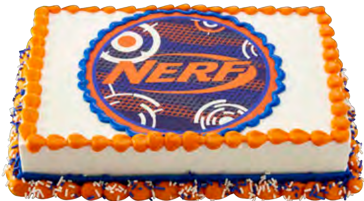
Sheet Cake 23602, 20696, 20704 Shown on 1/4 Sheet Cake