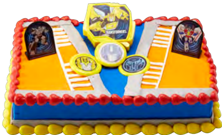
Sheet Cake 21943 Shown on 1/4 Sheet Cake