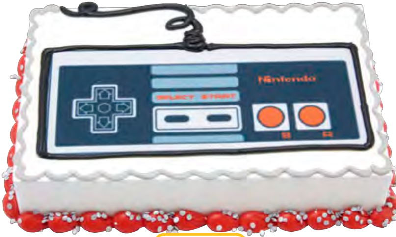
Sheet Cake 25743, 24047 Shown on 1/4 Sheet Cake

PERSONALIZE your cake by adding your own message & icing colors