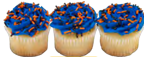
Cupcakes 20696, 20700 Available in your choice of icing color!