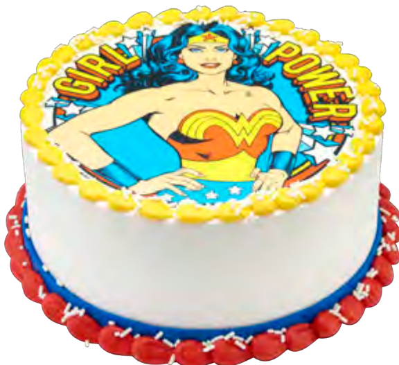
Double Layer 8" Round Cake 37416, 20704

PERSONALIZE your cake by adding your own message & icing colors