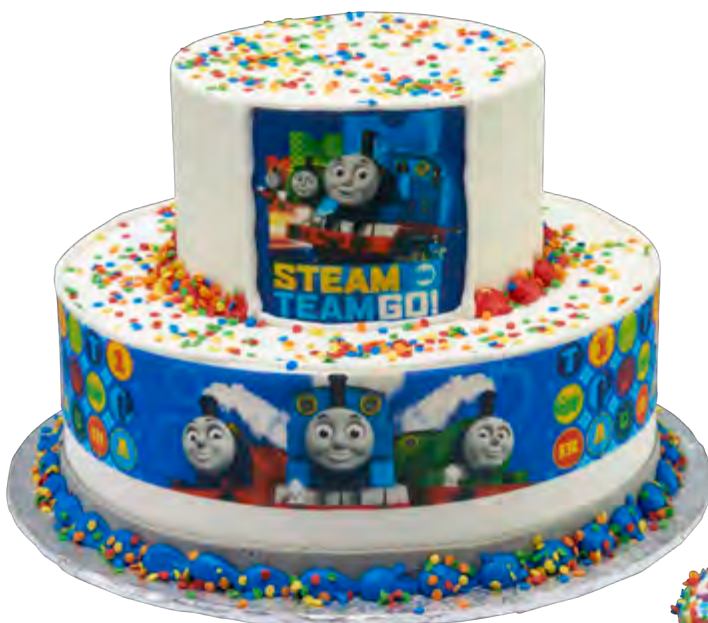
Two Tier Cake 7913, 21751, 20694