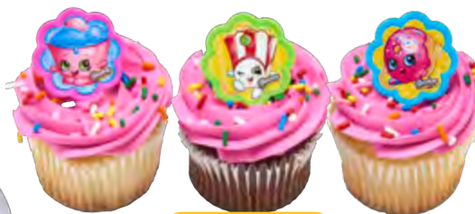
Cupcakes 58135, 20702 Available in your choice of icing color!