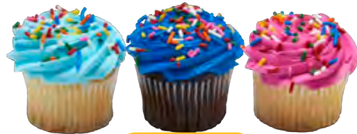
Cupcakes 20702 Available in your choice of icing color!