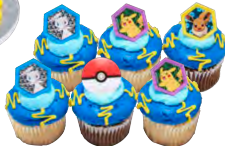
Custom Cupcakes 58139 Available in your choice of icing color!

3+ WARNING Age Grade CHOKING HAZARD-Small parts. Not for children under 3 years. Bakery is required to follow the licensor approved cake design shown. ©2020 POKEMON Co Intl, TM, ® Nintendo