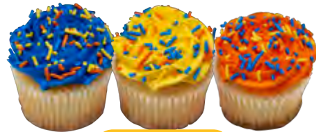
Cupcakes 20700, 20697, 20705 Available in your choice of icing color!