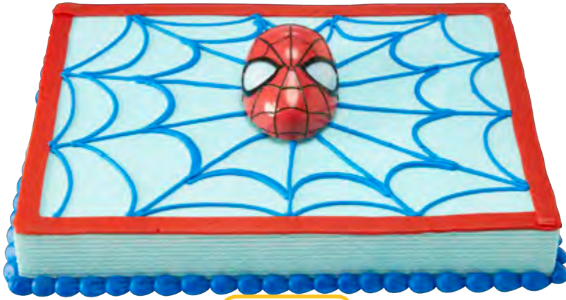
Sheet Cake 7891 Shown on 1/4 Sheet Cake

PERSONALIZE your cake by adding your own message