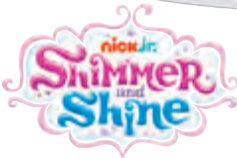
Two Tier Cake 43969, 19162, 20709