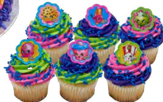
Custom Cupcakes 58135, 20698 Available in your choice of icing color!

3+ WARNING Age Grade CHOKING HAZARD—Small parts. Not for children under 3 years. Bakery is required to follow the licensor approved cake design shown. ©2020 Moose. Shopkins™ logos, names and characters are licensed trademarks of Moose Enterprise Pty Ltd. All rights reserved.