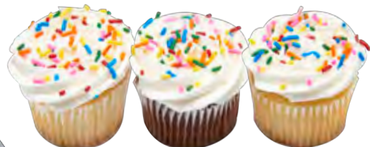
Cupcakes 20702 Available in your choice of icing color!