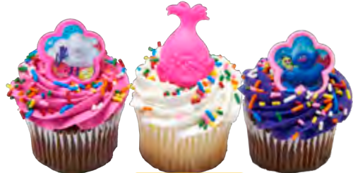
Cupcakes 24678, 20702 Available in your choice of icing color!