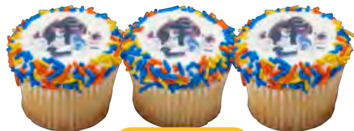
Custom Cupcakes 23492, 20700, 20697, 20705 Available in your choice of icing color!

© Universal City Studios LLC. All rights reserved.