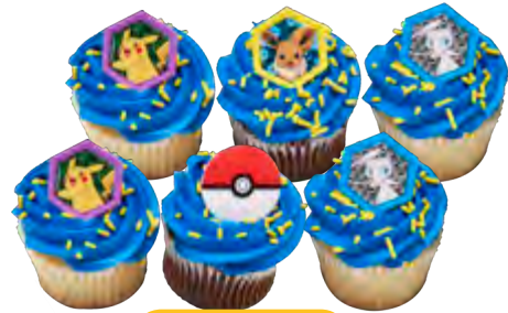
Cupcakes 58139, 20705 Available in your choice of icing color!