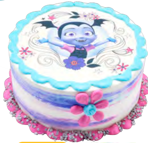
Double Layer 8" Round Cake 23334, 24047

PERSONALIZE your cake by adding your own message & icing colors