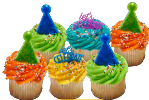
Cupcakes 37990, 24060, 20710 Available in your choice of icing color!