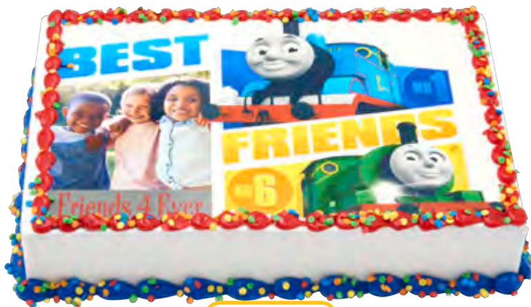
Sheet Cake 21750, 20694 Shown on 1/4 Sheet Cake