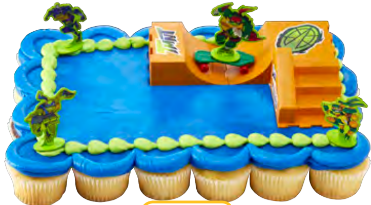
Cupcake Cake 24103