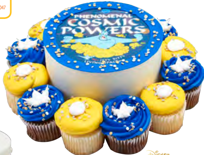
Party Combo 24183, 24048, 24047