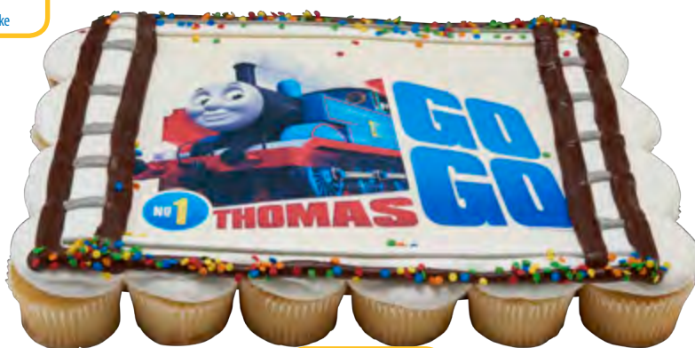
Cupcake Cake 21752, 20694