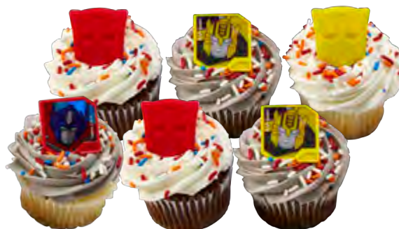
Cupcakes 21874, 20702 Available in your choice of icing color!