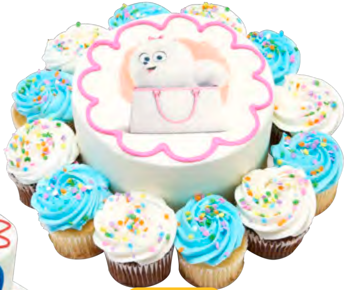
Party Combo 23491, 20695