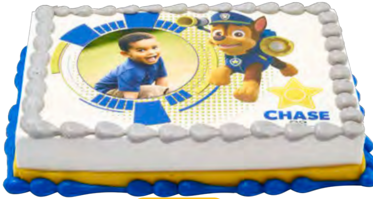
Sheet Cake 18730 Shown on ¼ Sheet Cake

PERSONALIZE your cake by adding your own message, photo & icing colors