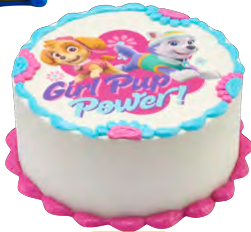
Double Layer 8" Round Cake 20950