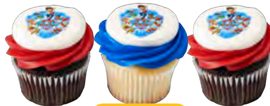
Custom Cupcakes 4981 Available in your choice of icing color!

3+ WARNING Age Grade CHOKING HAZARD-Small parts. Not for children under 3 years. ©2020 Spin Master PAW Productions Inc. All rights reserved.