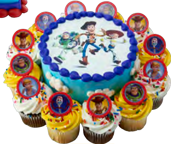
Party Combo 24720, 24136, 20702