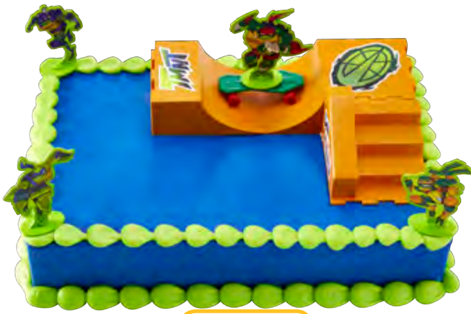
Sheet Cake 24103 Shown on 1/4 Sheet Cake

PERSONALIZE your cake by adding your own message