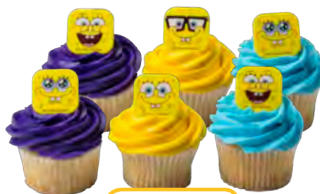
Cupcakes 18030 Available in your choice of icing color!