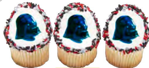
Custom Cupcakes 23440, 20703, 20696, 24047 Available in your choice of icing color!