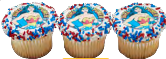
Custom Cupcakes 37416, 20703, 20704, 20697 Available in your choice of icing color!