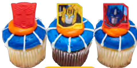
Custom Cupcakes 21874 Available in your choice of icing color!

PERSONALIZE your cake by adding your own message