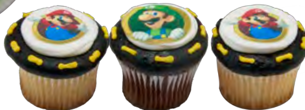
Custom Cupcakes 23364, 23368 Available in your choice of icing color!

PERSONALIZE your cake by adding your own message