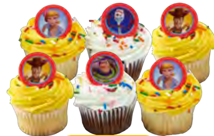
Cupcakes 24720, 20702 Available in your choice of icing color!