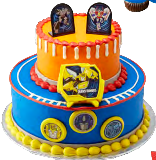
Two Tier Cake 21943