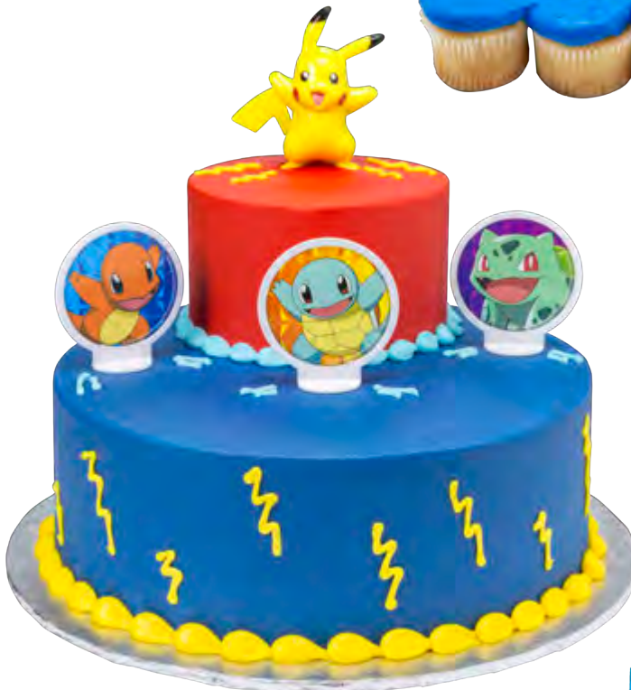
Two Tier Cake 38272