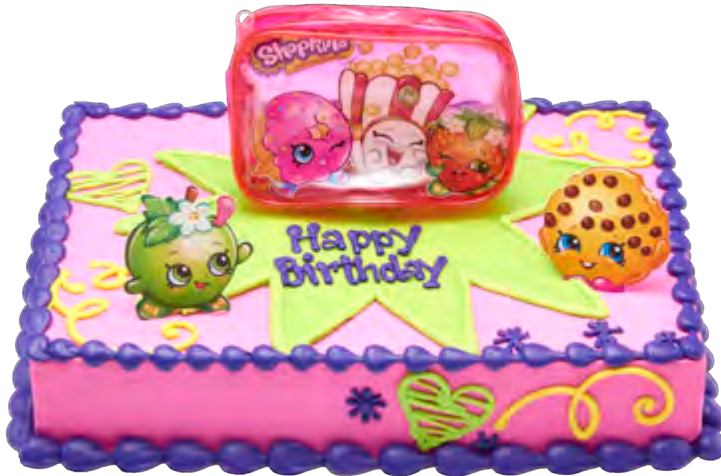
Sheet Cake 38929 Shown on ¼ Sheet Cake

PERSONALIZE your cake by adding your own message