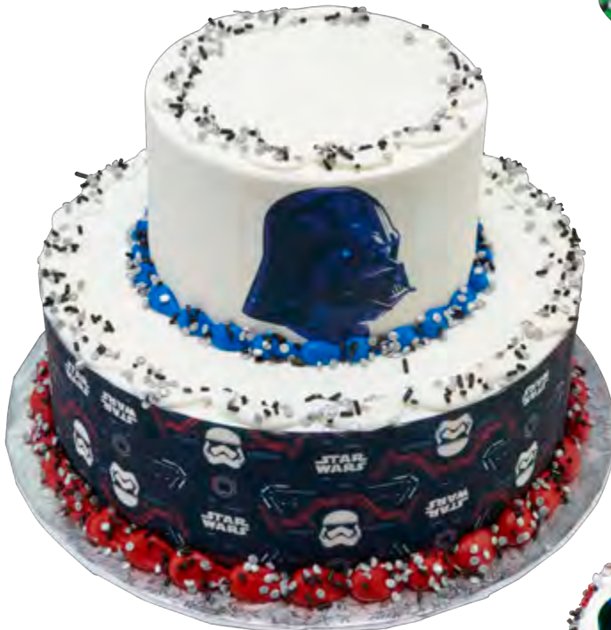
Two Tier Cake 23440, 25598, 20696, 24047