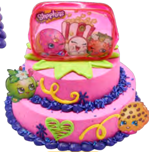
Mini Two Tier Cake 38929, 20697, 20698