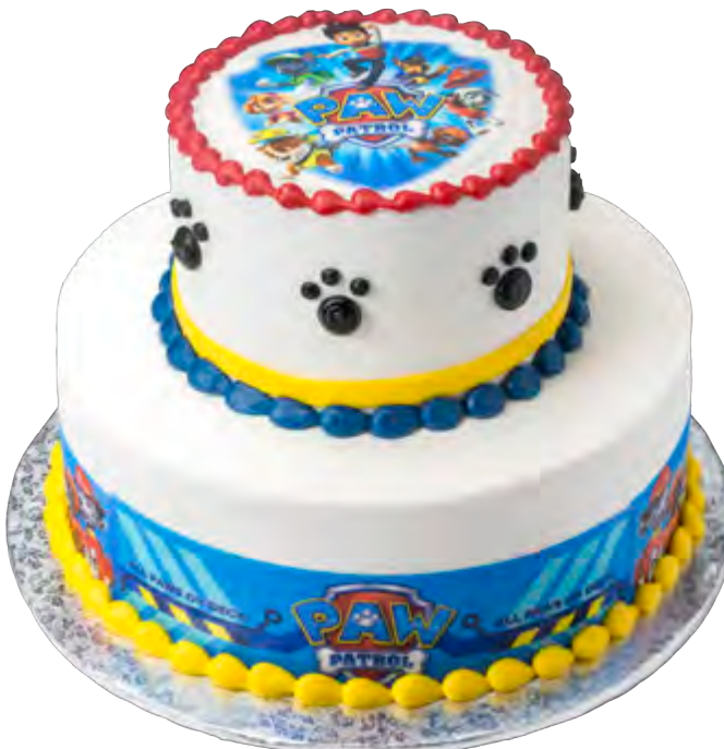
Two Tier Cake 4981, 7442