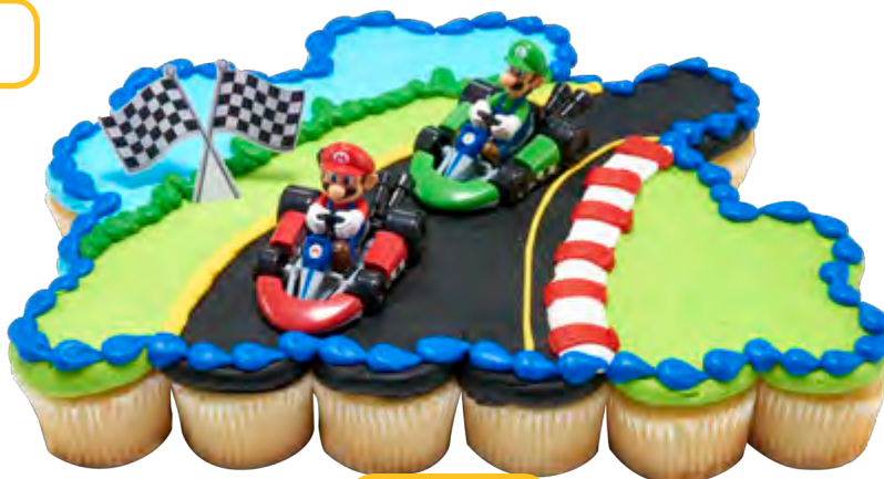
Cupcake Cake 7630