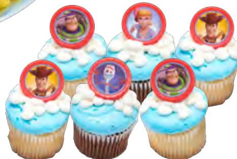
Custom Cupcakes 24720 Available in your choice of icing color!

3+ WARNING Age Grade CHOKING HAZARD—Small parts. Not for children under 3 years. Bakery is required to follow the licensor approved cake design shown. ©Disney/Pixar