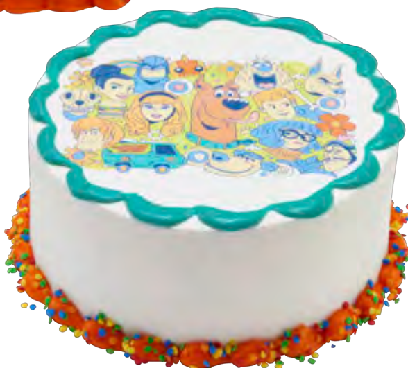
Double Layer 8" Round Cake 25638, 20694