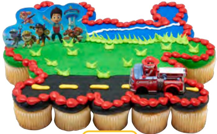
Cupcake Cake 6089