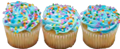
Cupcakes 20695 Available in your choice of icing color!