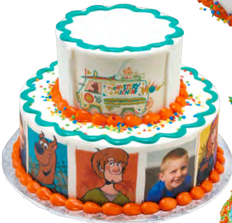
Two Tier Cake 25639, 25637, 20694