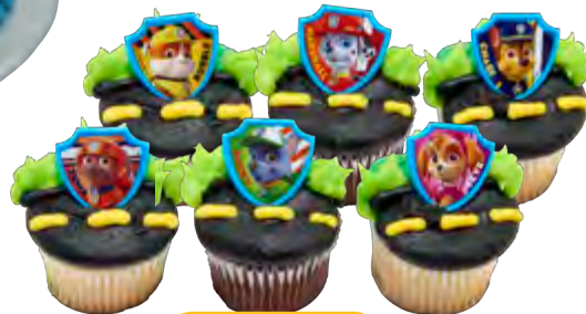
Custom Cupcakes 18693 Available in your choice of icing color!

PERSONALIZE your cake by adding your own message