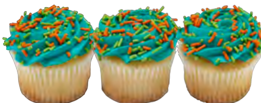
Cupcakes 20700, 20699 Available in your choice of icing color!