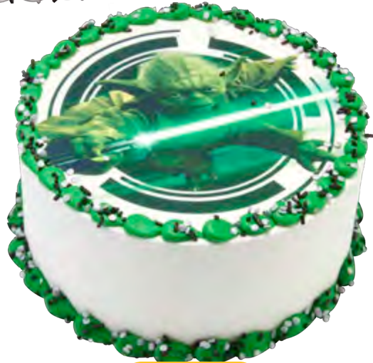
Double Layer 8" Round Cake 36293, 20696, 24047