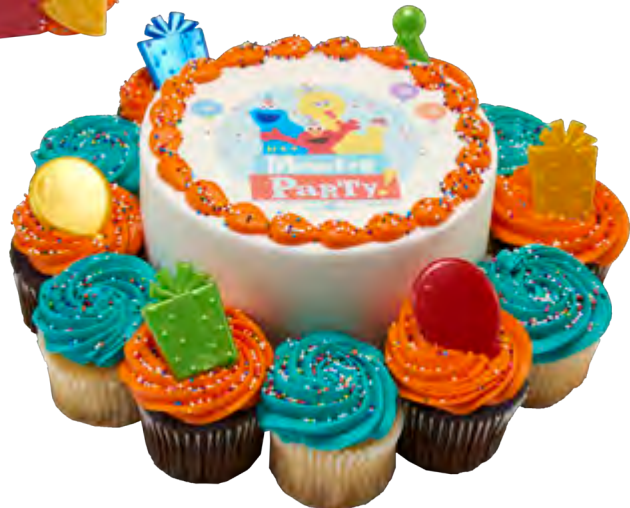
Party Combo 37990, 20989, 20710