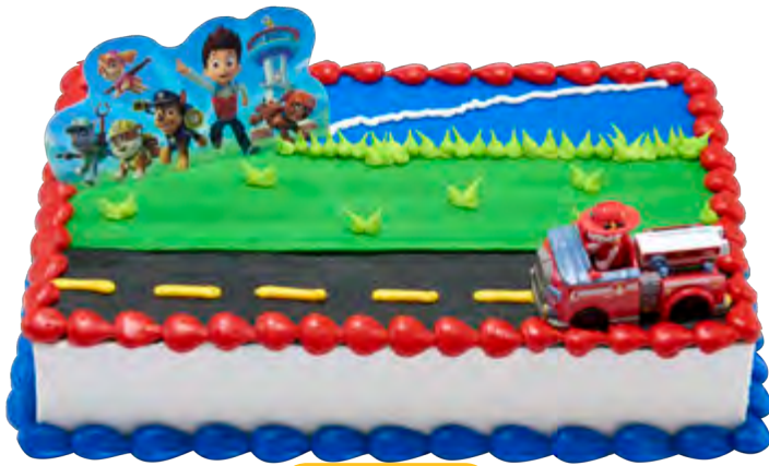
Sheet Cake 6089 Shown on ¼ Sheet Cake