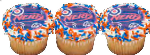
Custom Cupcakes 23602, 20700, 20697, 20704 Available in your choice of icing color!

PERSONALIZE your cake by adding your own message & icing colors