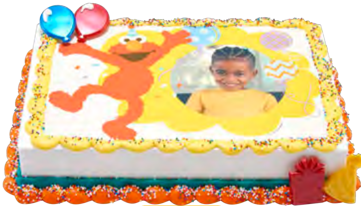
Sheet Cake 37990, 20987, 20710 Shown on 1/4 Sheet Cake

PERSONALIZE your cake by adding your own message, photo & icing colors