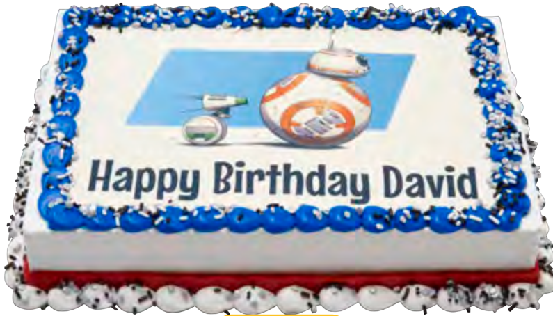
Sheet Cake 25595, 20696, 24047 Shown on 1/4 Sheet Cake

PERSONALIZE your cake by adding your own message & icing colors