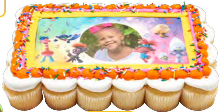
Cupcake Cake 25645, 20702