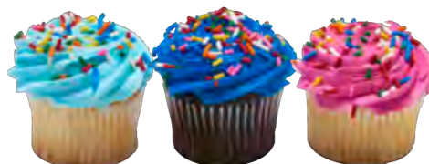
Cupcakes 20702 Available in your choice of icing color!