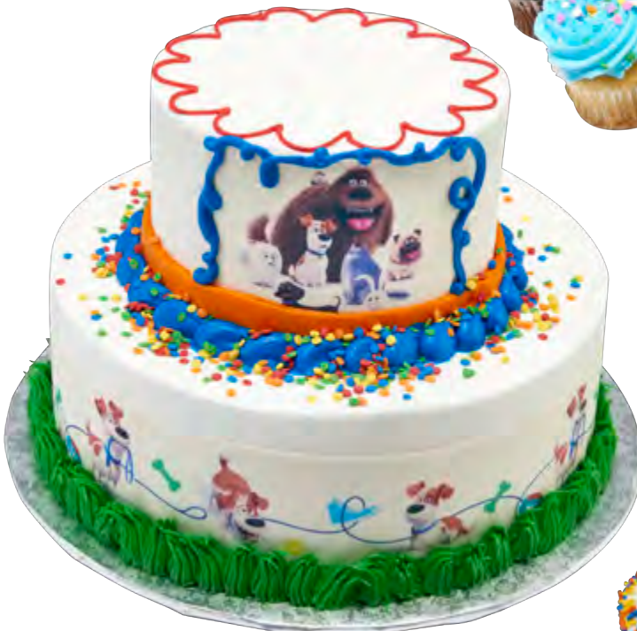
Two Tier Cake 23492, 24679, 20694