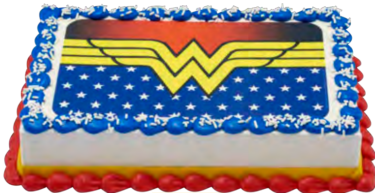
Sheet Cake 22762, 20704 Shown on 1/4 Sheet Cake

PERSONALIZE your cake by adding your own message & icing colors