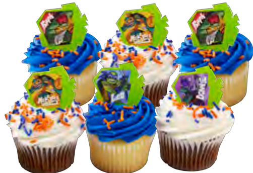
Cupcakes 24221, 20700, 20697 Available in your choice of icing color!