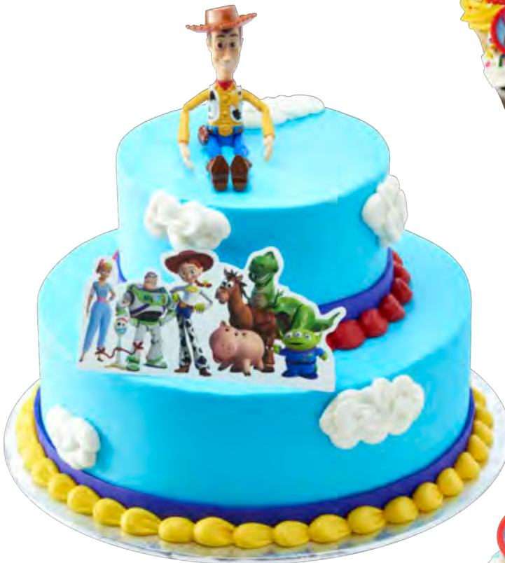
Two Tier Cake 24330