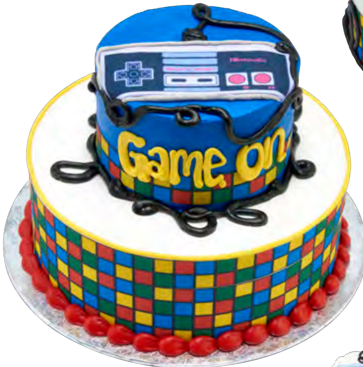
Two Tier Cake 25743, 472