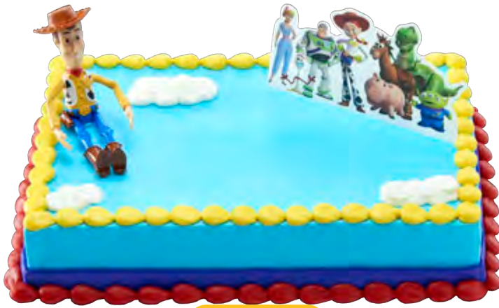
Sheet Cake 24330 Shown on ¼ Sheet Cake

PERSONALIZE your cake by adding your own message