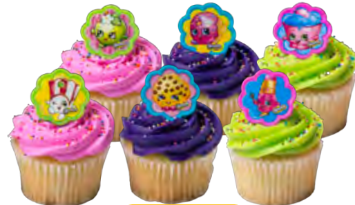
Cupcakes 58135, 20710 Available in your choice of icing color!