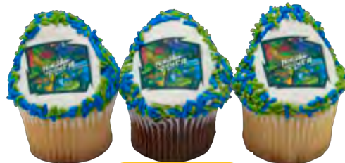
Custom Cupcakes 24135, 20699, 20697 Available in your choice of icing color!

3+ WARNING Age Grade CHOKING HAZARD—Small parts. Not for children under 3 years. Bakery is required to follow the licensor approved cake design shown. © 2020 Viacom International, Inc.