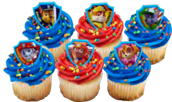
Cupcakes 23058, 20694 Available in your choice of icing color!