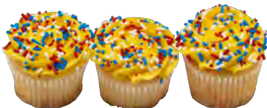
Cupcakes 20703, 20704, 20697 Available in your choice of icing color!