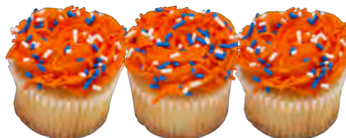
Cupcakes 20700, 20697, 20704 Available in your choice of icing color!