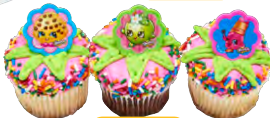
Custom Cupcakes 58135, 20702 Available in your choice of icing color!

PERSONALIZE your cake by adding your own message, photo & icing colors