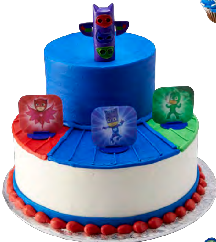
Two Tier Cake 23313