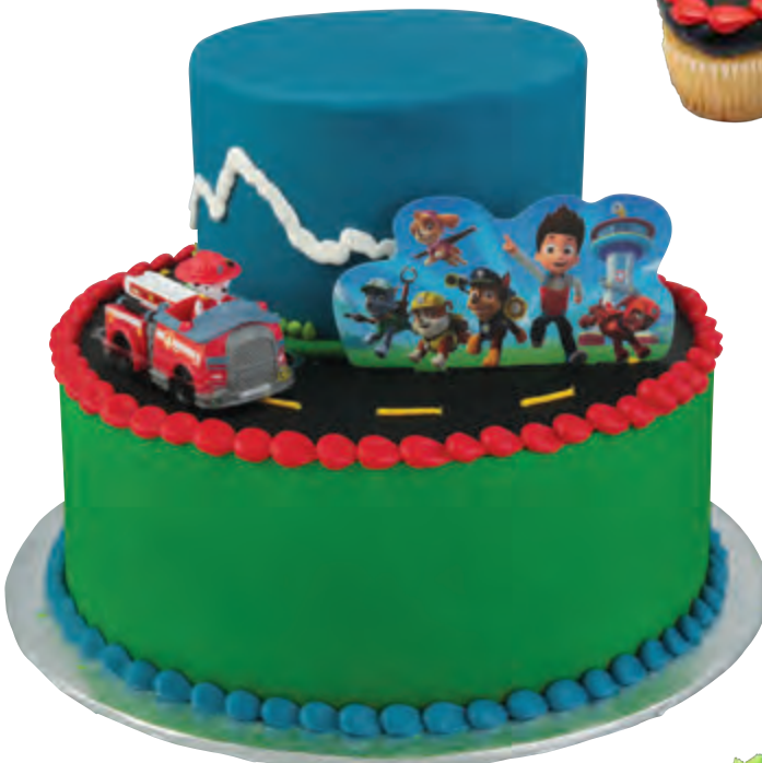
Two Tier Cake 6089