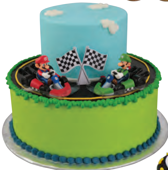
Two Tier Cake 7630