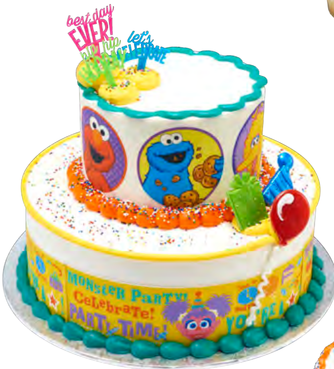
Two Tier Cake 37990, 24060, 7568, 20990, 20710