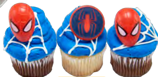
Custom Cupcakes 24082 Available in your choice of icing color!

3+ WARNING Age Grade CHOKING HAZARD—Small parts. Not for children under 3 years. Bakery is required to follow the licensor approved cake design shown. ©2020 Marvel MARVEL