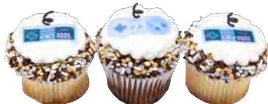
Custom Cupcakes 25743, 25744, 24047, 24048, 20704 Available in your choice of icing color!