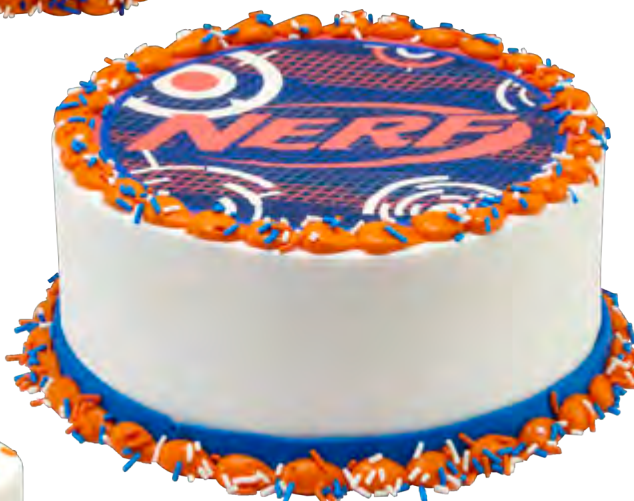
Double Layer 8" Round Cake 23602, 20700, 20697, 20704