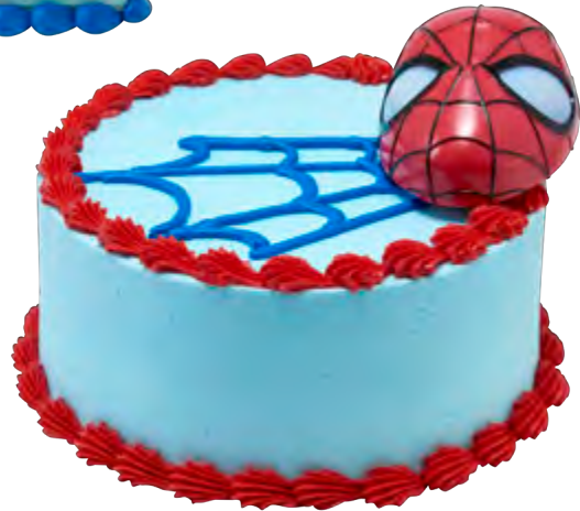
Double Layer 8" Round Cake 7891