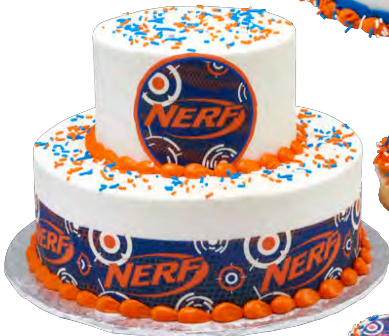
Two Tier Cake 23602, 23603, 20700, 20697, 20707