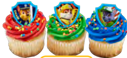
Cupcakes 18693, 20694 Available in your choice of icing color!