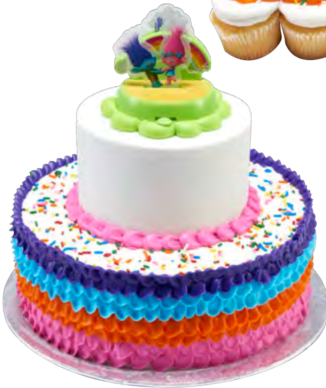
Two Tier Cake 24585, 20702