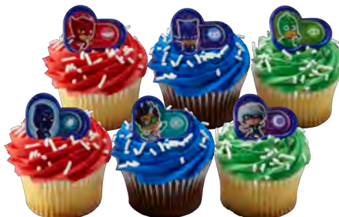
Cupcakes 23058, 20704 Available in your choice of icing color!