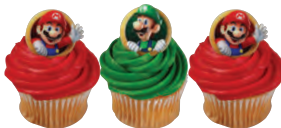
Cupcakes 38037 Available in your choice of icing color!