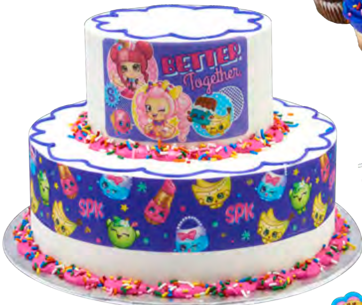
Two Tier Cake 23502, 21668, 20702