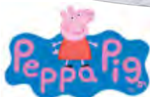
Two Tier Cake 21859, 21858, 20702