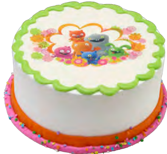
Double Layer 8" Round Cake 24198, 20695