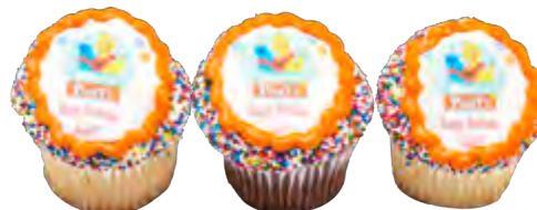
Custom Cupcakes 20989, 20710 Available in your choice of icing color!