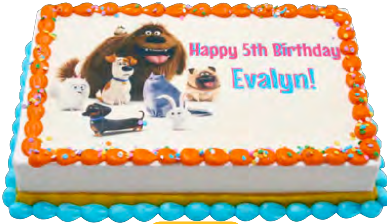
Sheet Cake 23492 Shown on ¼ Sheet Cake

PERSONALIZE your cake by adding your own message & icing colors