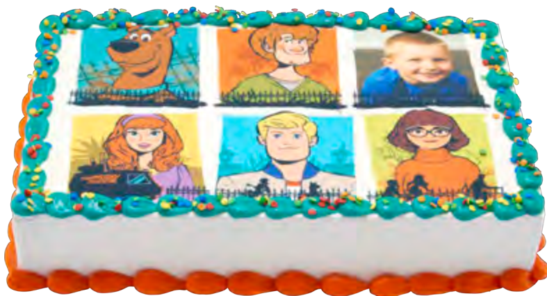
Sheet Cake 25637, 20694 Shown on 1/4 Sheet Cake