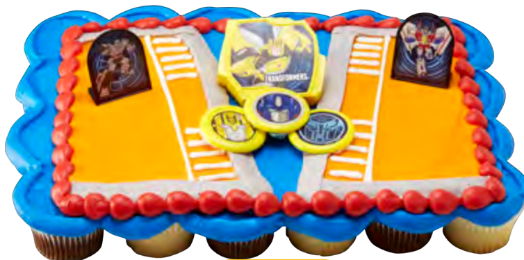
Cupcake Cake 21943