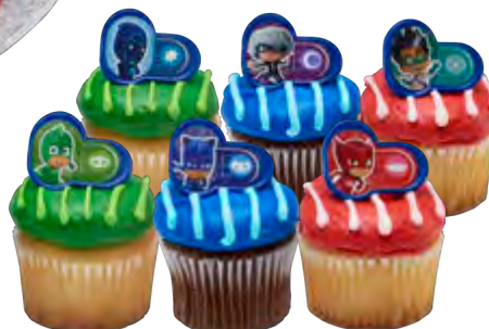
Custom Cupcakes 23058 Available in your choice of icing color!

PERSONALIZE your cake by adding your own message