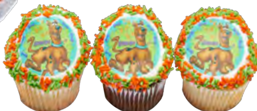
Custom Cupcakes 37516, 20700, 20699 Available in your choice of icing color!

PERSONALIZE your cake by adding your own message, photo & icing colors