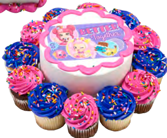
Party Combo 23502, 20702