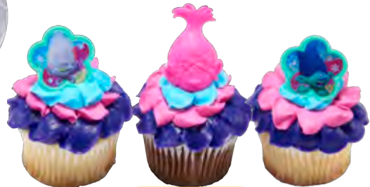
Custom Cupcakes 24678 Available in your choice of icing color!

3+ WARNING Age Grade CHOKING HAZARD—Small parts. Not for children under 3 years. Bakery is required to follow the licensor approved cake design shown. DreamWorks Trolls © 2020 DreamWorks Animation LLC. All Rights Reserved.