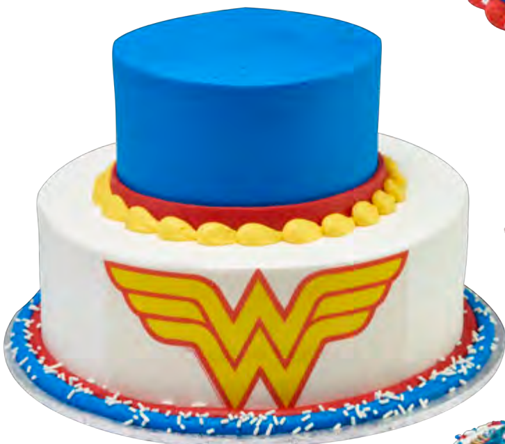
Two Tier Cake 6586, 20704