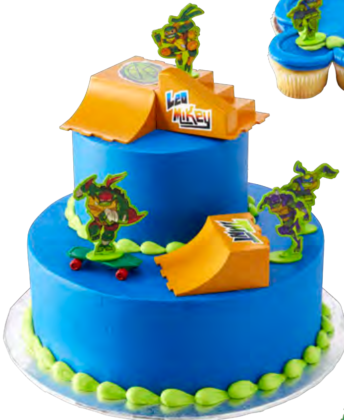
Two Tier Cake 24103