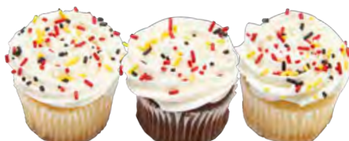
Cupcakes 20696, 20703, 20705, 20704 Available in your choice of icing color!