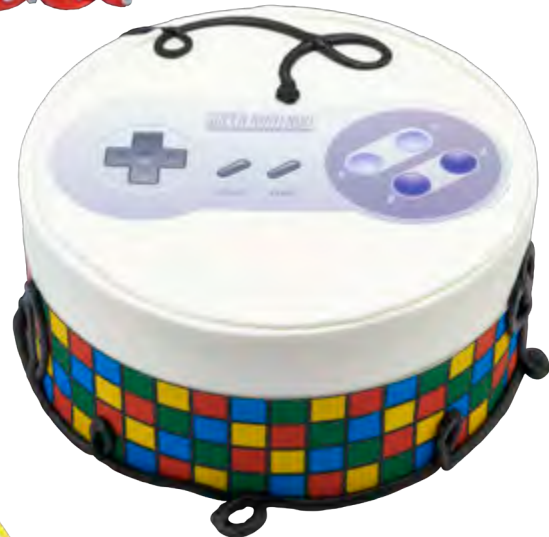
Double Layer 8" Round Cake 25744, 472