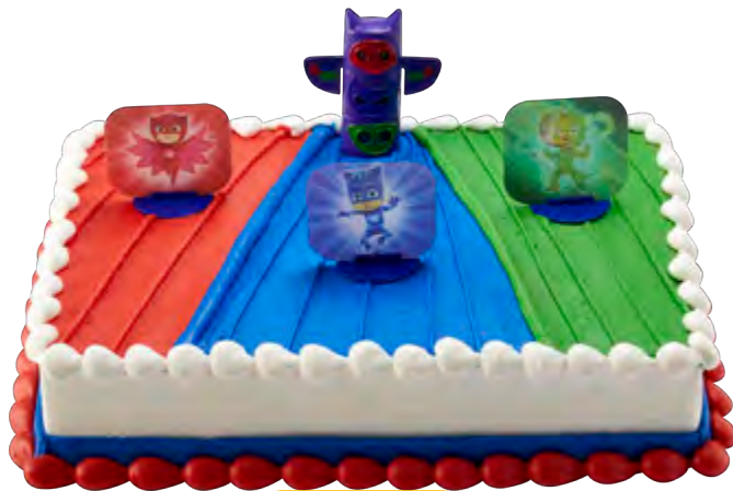
Sheet Cake 23313 Shown on 1/4 Sheet Cake