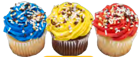
Cupcakes 24047, 24048, 20704, 20696 Available in your choice of icing color!