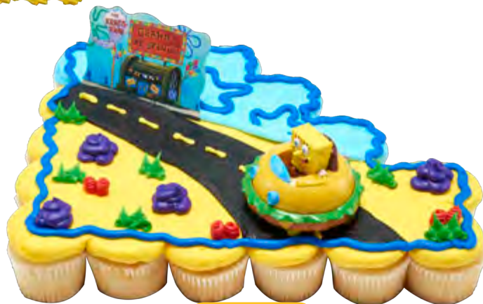
Cupcake Cake 6086