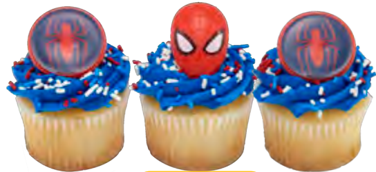
Cupcakes 24082, 20703, 20704, 20697 Available in your choice of icing color!