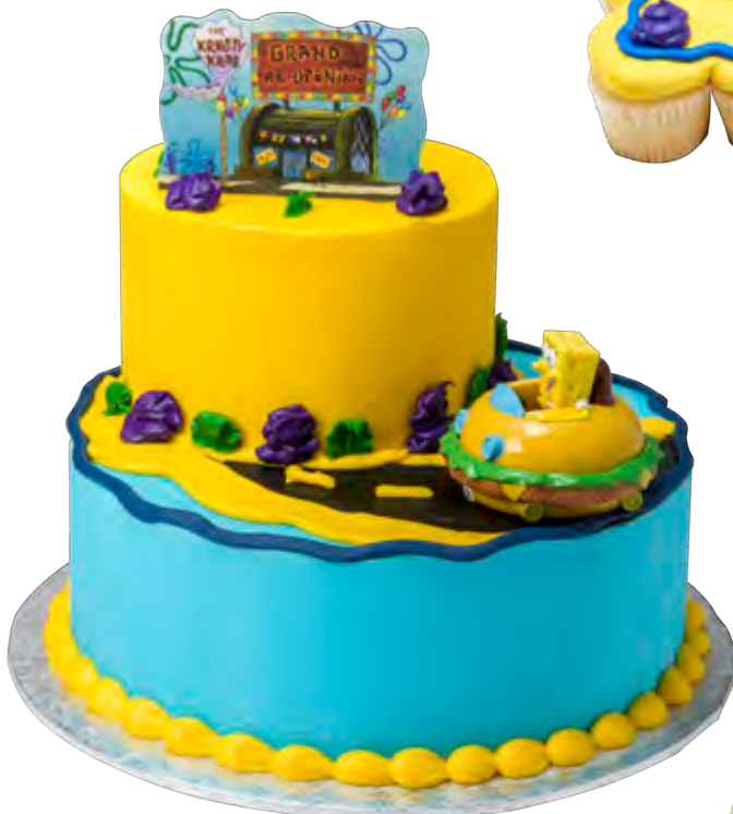
Two Tier Cake 6086