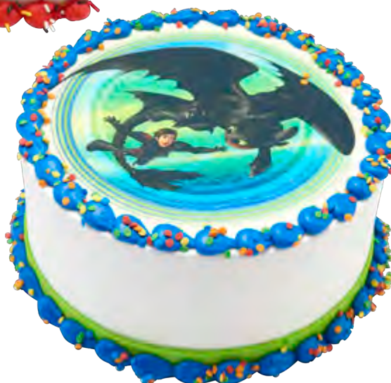
Double Layer 8" Round Cake 24121, 20694

PERSONALIZE your cake by adding your own message & icing colors