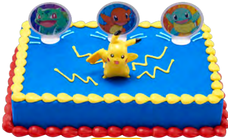
Sheet Cake 38272 Shown on 1/4 Sheet Cake

PERSONALIZE your cake by adding your own message