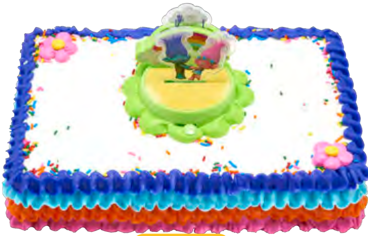
Sheet Cake 24585, 20702 Shown on ¼ Sheet Cake

PERSONALIZE your cake by adding your own message, photo & icing colors