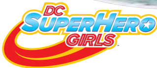
Two Tier Cake 25668, 25669