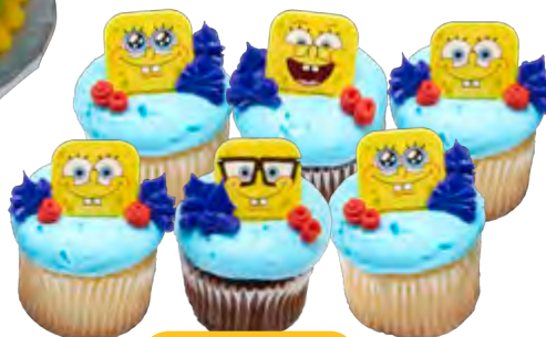
Custom Cupcakes 18030 Available in your choice of icing color!

PERSONALIZE your cake by adding your own message