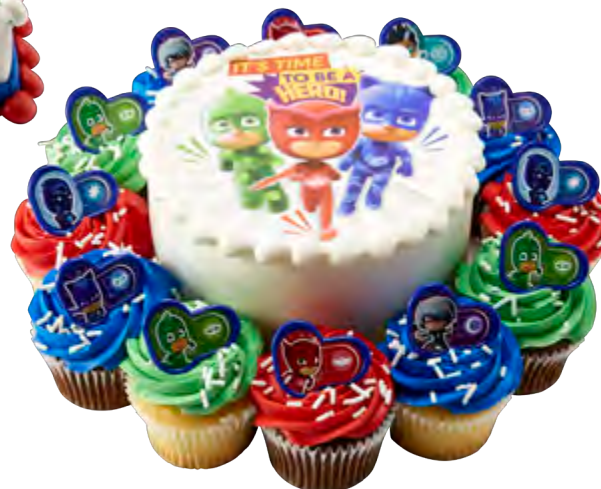
Party Combo 23058, 44535, 20704