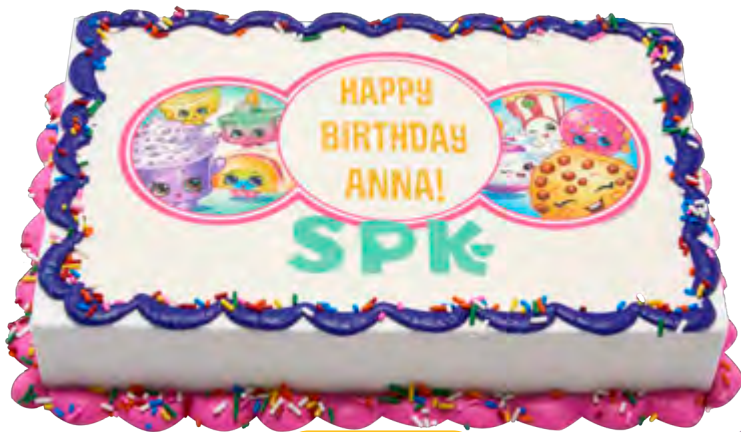
Sheet Cake 21667, 20702 Shown on 1/4 Sheet Cake