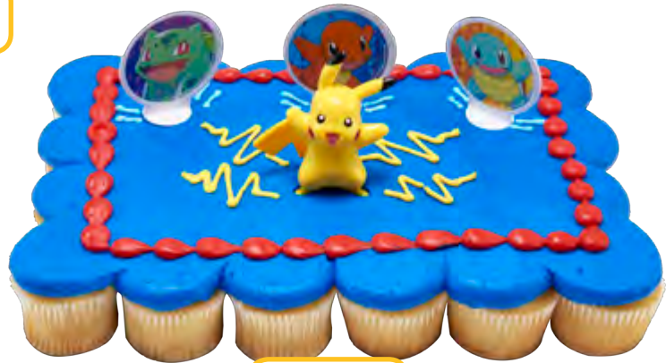
Cupcake Cake 38272