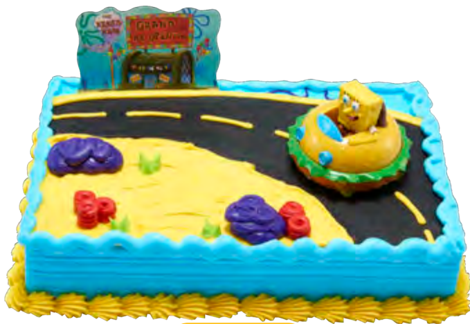
Sheet Cake 6086 Shown on 1/4 Sheet Cake