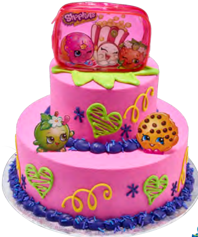
Two Tier Cake 38929, 20697, 20698