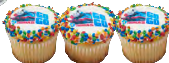
Custom Cupcakes 21752, 20694 Available in your choice of icing color!

PERSONALIZE your cake by adding your own message, photo & icing colors