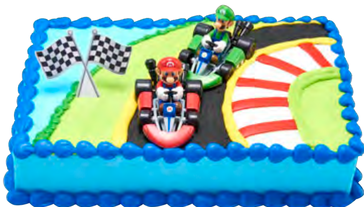
Sheet Cake 7630 Shown on 1/4 Sheet Cake