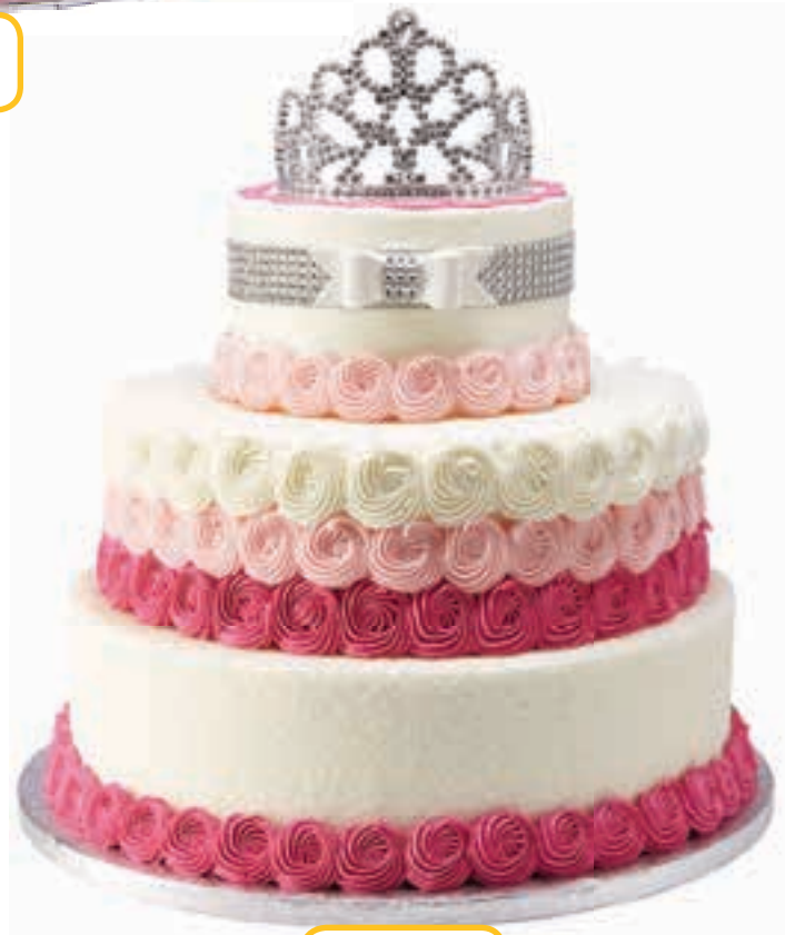
Three Tier Cake Serves 134 100/140 cal. per slice