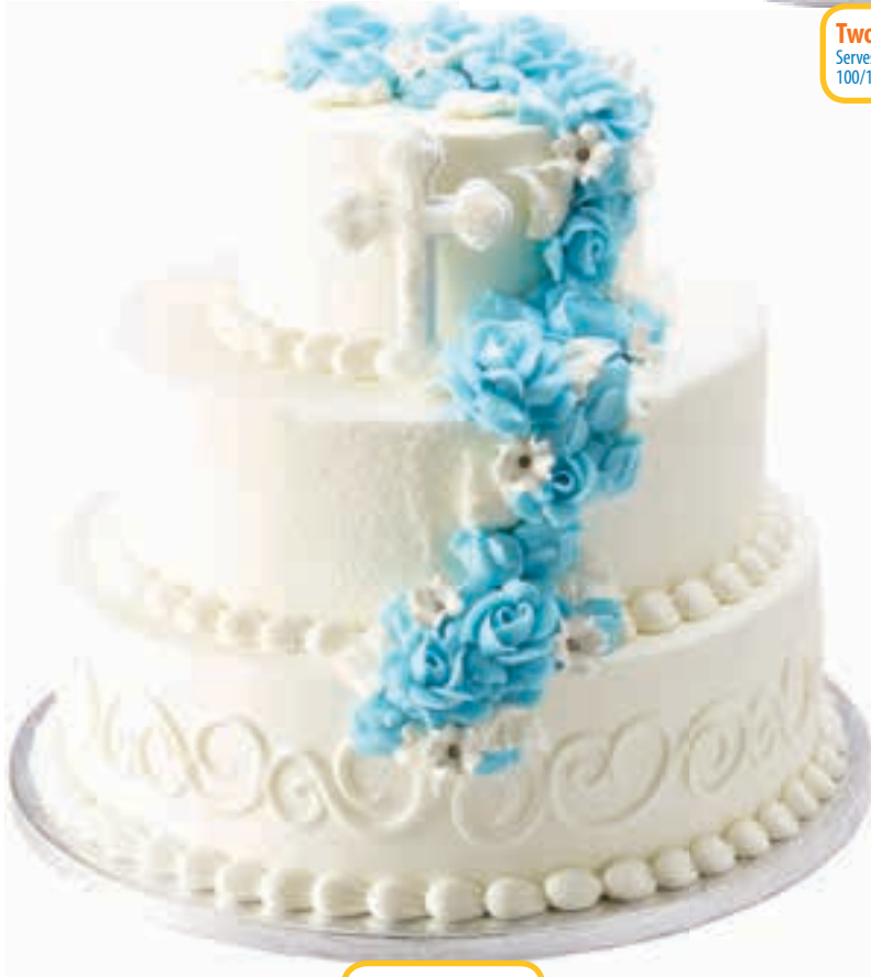
Three Tier Cake Serves 134 100/140 cal. per slice