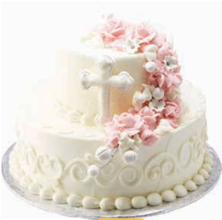
Two Tier Cake Serves 64 100/170 cal. per slice