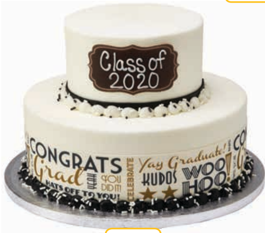
Two Tier Cake Serves 64 100/170 cal. per slice