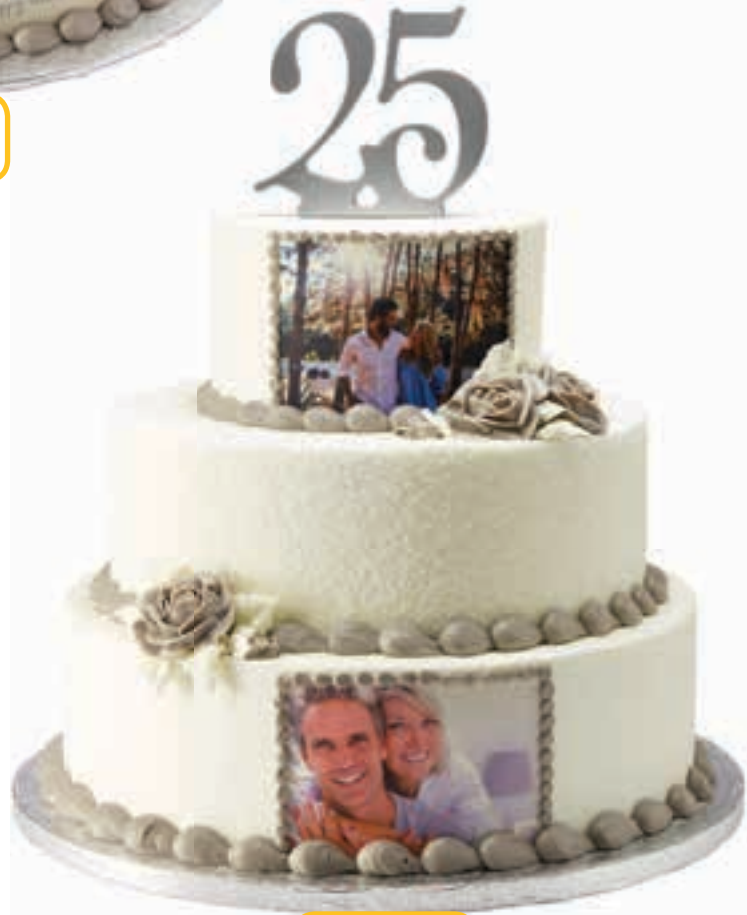
Three Tier Cake Serves 134 100/140 cal. per slice

3+ Age Grade WARNING CHOKING HAZARD-Small parts. Not for children under 3 years.