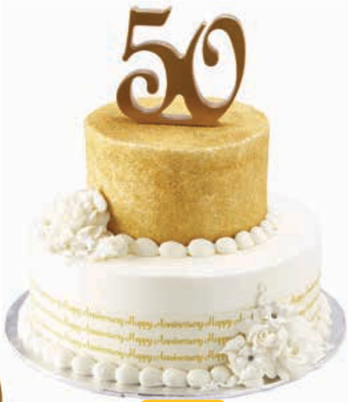
Two Tier Cake Serves 64 100/170 cal. per slice