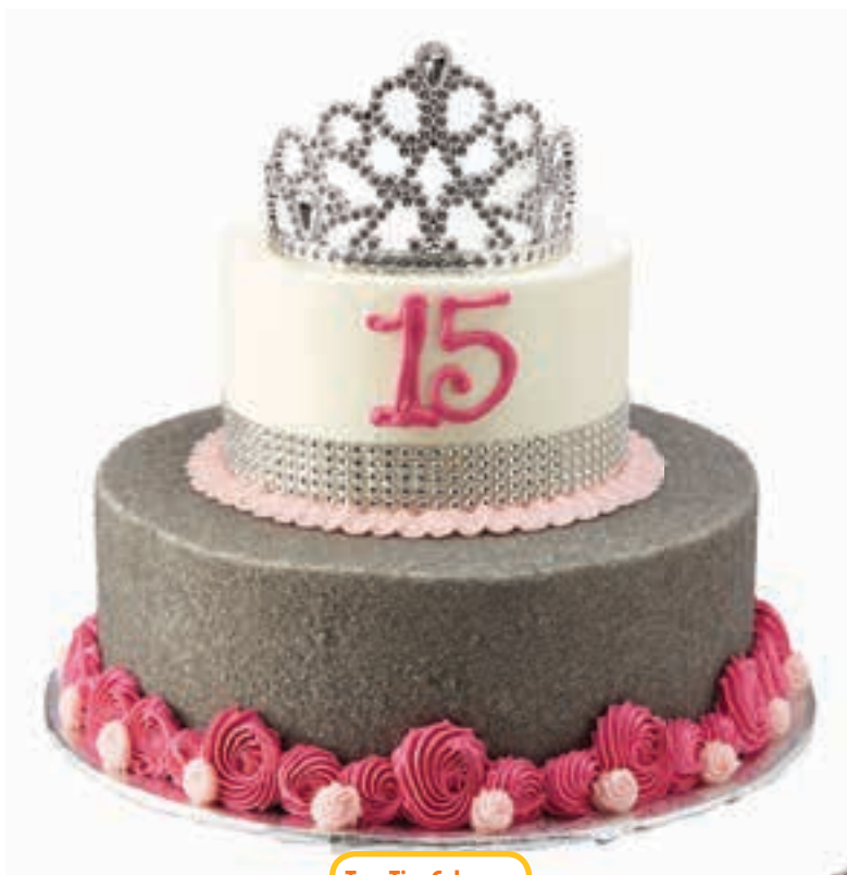
Two Tier Cake Serves 64 100/170 cal. per slice