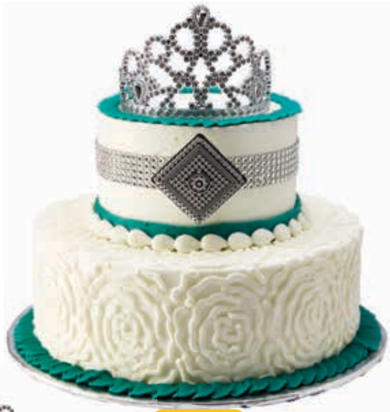
Two Tier Cake Serves 64 100/170 cal. per slice