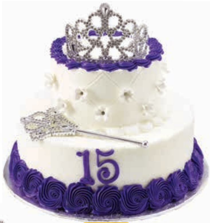
Two Tier Cake Serves 64 100/170 cal. per slice