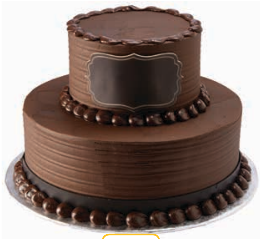
Two Tier Cake Serves 64 100/170 cal. per slice