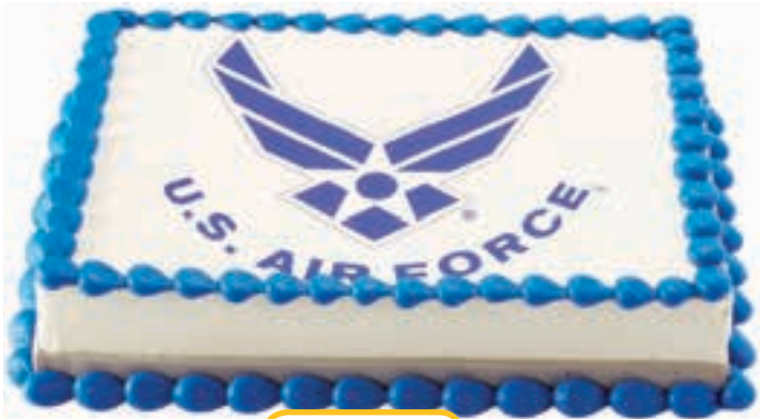
Sheet Cake Shown on 1/4 Sheet Cake Serves 24 170-320 cal. per slice