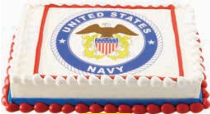
Sheet Cake Shown on 1/4 Sheet Cake Serves 24 170-320 cal. per slice