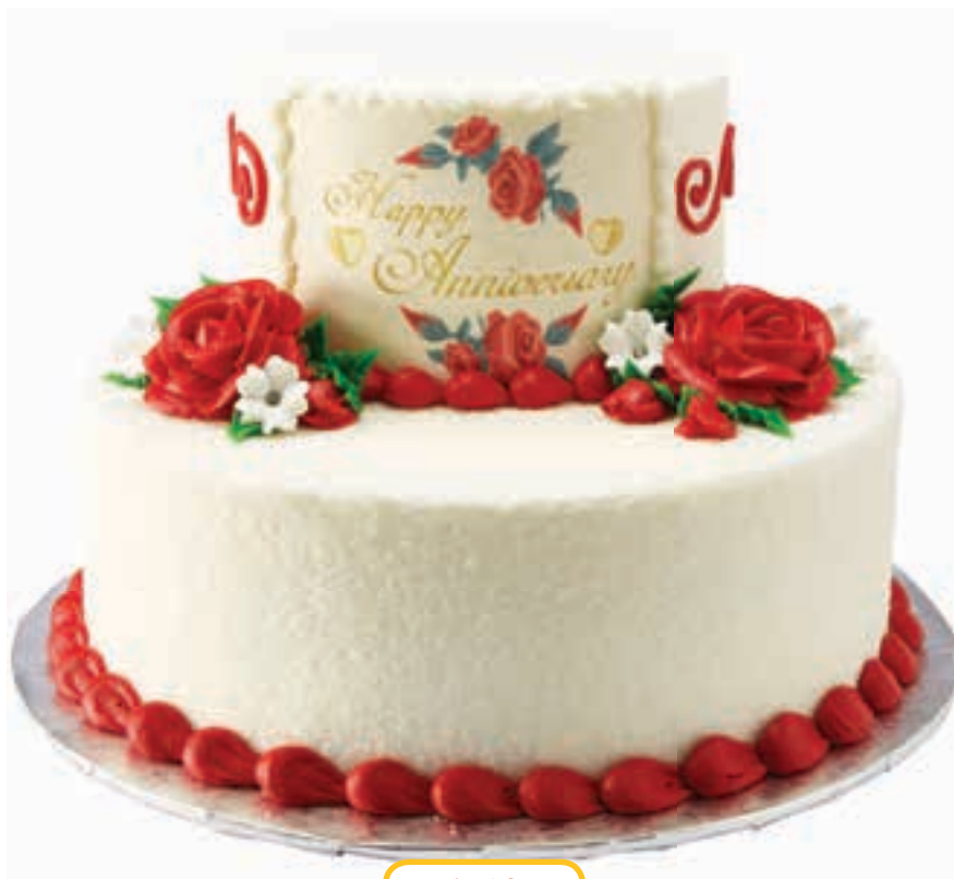
Two Tier Cake Serves 64 100/170 cal. per slice