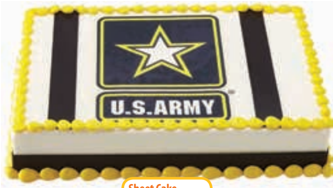
Sheet Cake Shown on 1/4 Sheet Cake Serves 24 170-320 cal. per slice

PERSONALIZE your cake by adding your own message, photo & icing colors