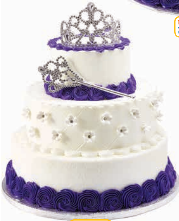
Three Tier Cake Serves 134 100/140 cal. per slice