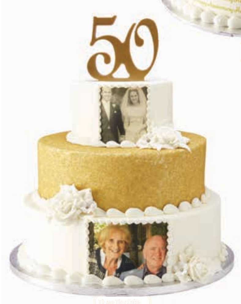
Three Tier Cake Serves 134 100/140 cal. per slice