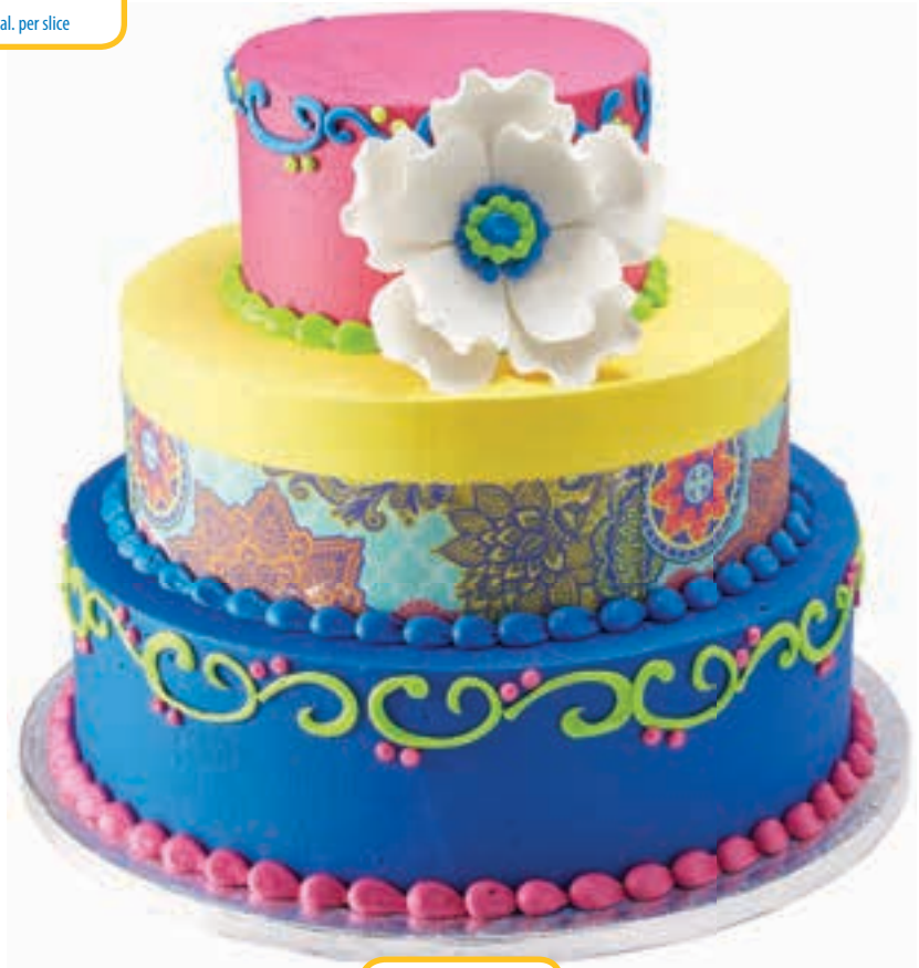
Three Tier Cake