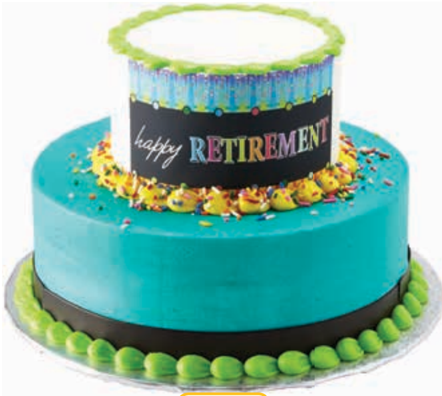
Two Tier Cake Serves 64 100/170 cal. per slice