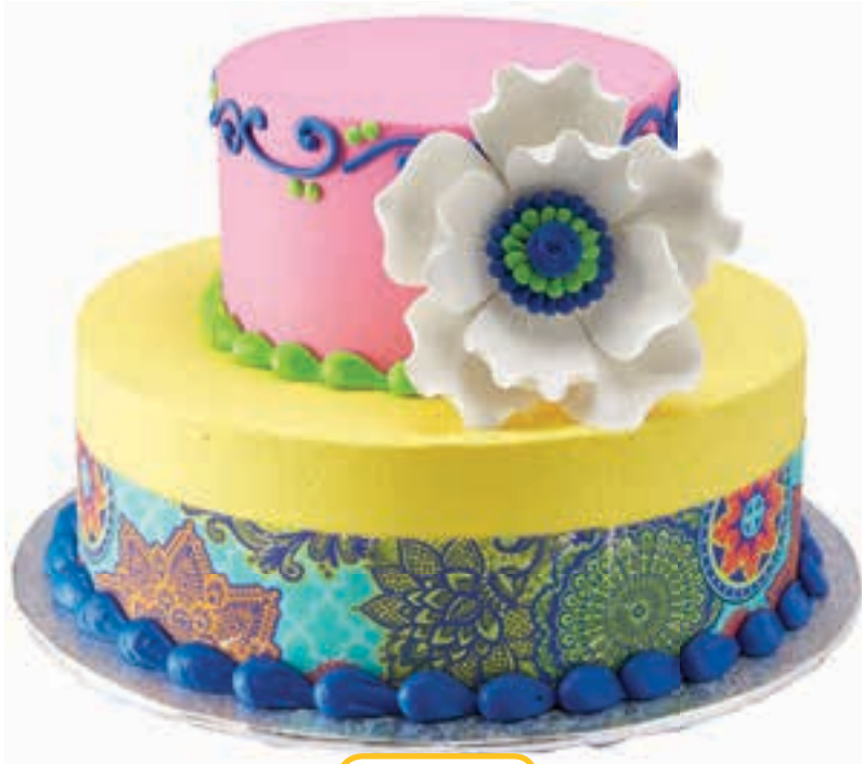
Two Tier Cake