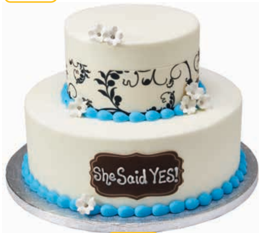
Two Tier Cake Serves 64 100/170 cal. per slice