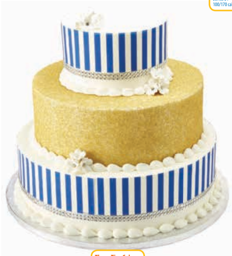
Three Tier Cake Serves 134 100/140 cal. per slice