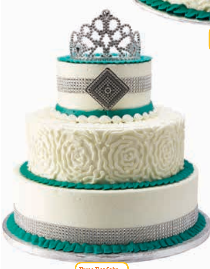
Three Tier Cake Serves 134 100/140 cal. per slice