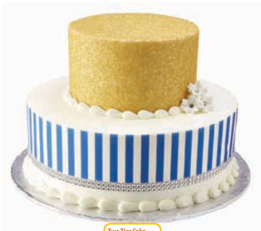
Two Tier Cake Serves 64 100/170 cal. per slice