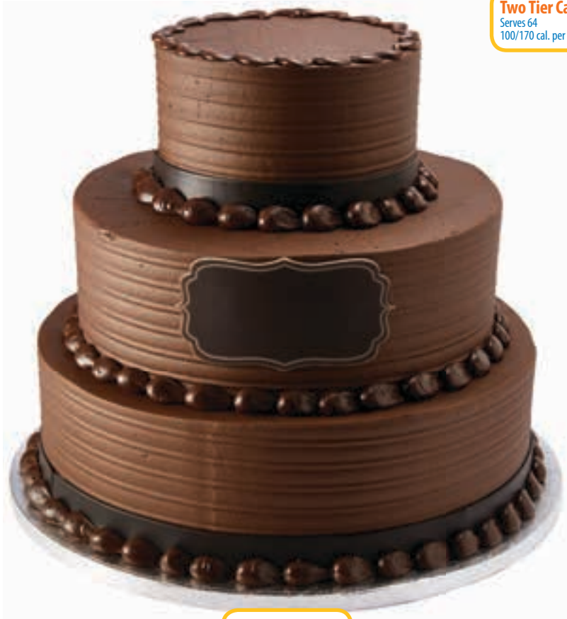
Three Tier Cake Serves 134 100/140 cal. per slice