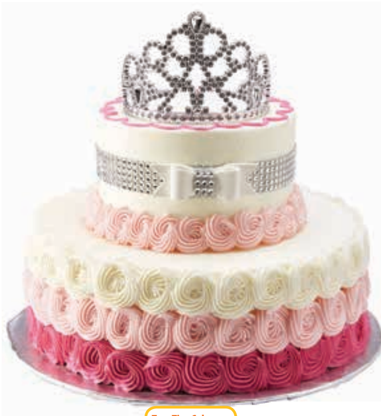
Two Tier Cake Serves 64 100/170 cal. per slice