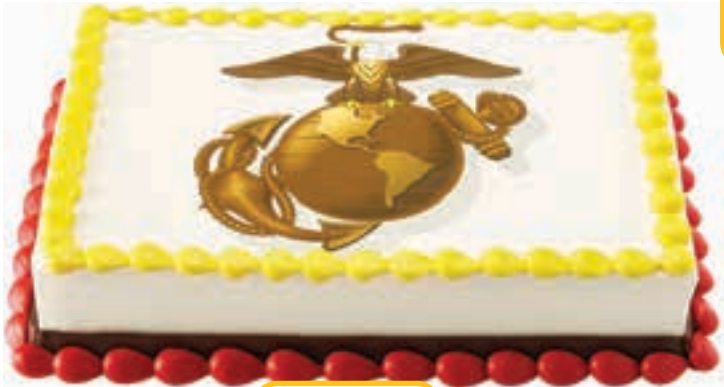
Sheet Cake Shown on 1/4 Sheet Cake Serves 24 170-320 cal. per slice