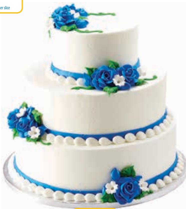
Three Tier Cake Serves 134 100/140 cal. per slice

3+ WARNING Age Grade CHOKING HAZARD—Small parts. Not for children under 3 years. Gum paste is food safe and intended as a non-edible decoration only.