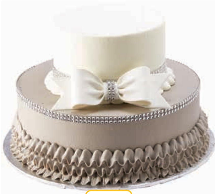
Two Tier Cake Serves 64 100/170 cal. per slice