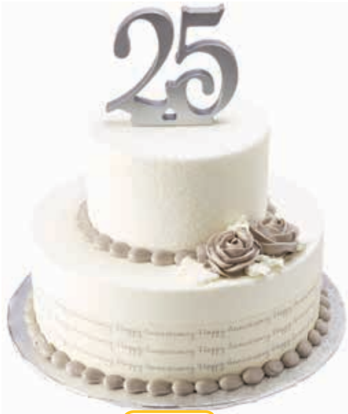
Two Tier Cake Serves 64 100/170 cal. per slice