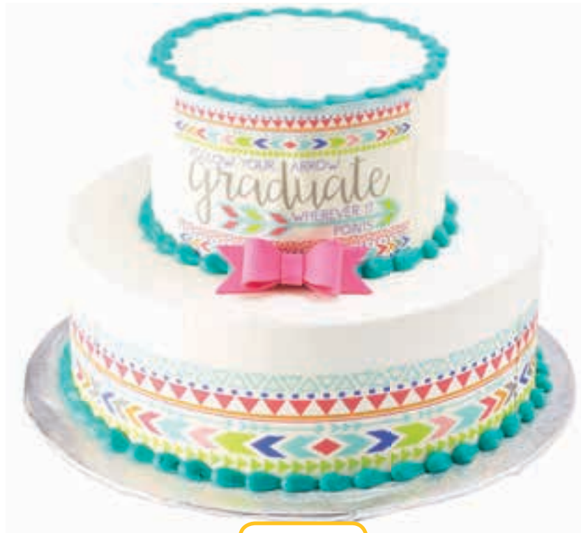
Two Tier Cake Serves 64 100/170 cal. per slice