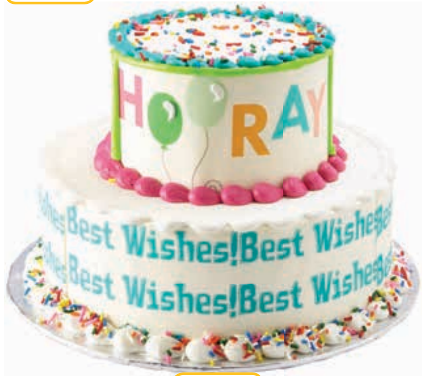
Two Tier Cake Serves 64 100/170 cal. per slice

3+ Age Grade WARNING CHOKING HAZARD-Small parts. Not for children under 3 years.