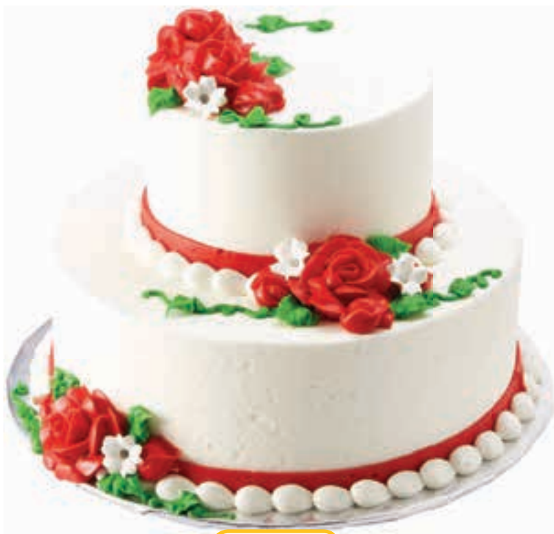
Two Tier Cake Serves 64 100/170 cal. per slice