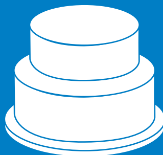
2-Tier Tier Round Cake

Available in White or Chocolate layers only Serves 64