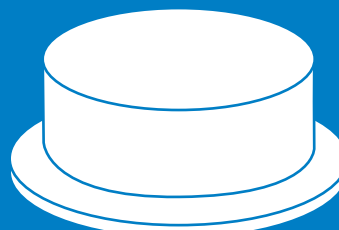
Single Layer 8" Round