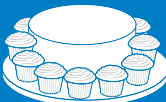
Party Combo Cake